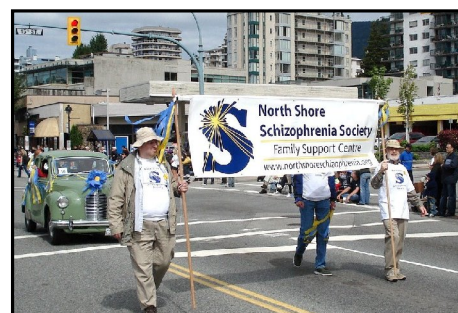
West Vancouver Community Day Parade