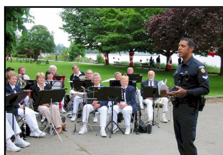
Walk the World for Schizophrenia